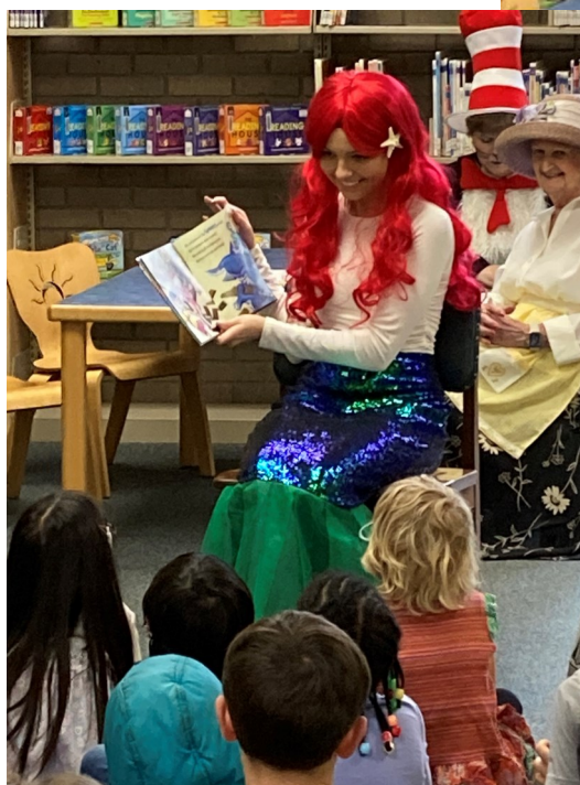
MFWC Clubwomen reading in character at State Convention, April 2023, Tupelo, MS.