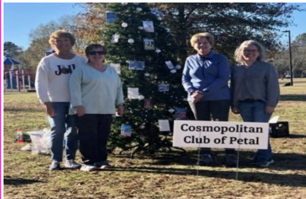
Cosmopolitan Club "Book" Christmas Tree